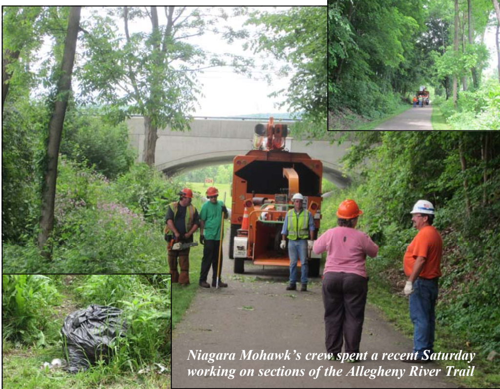
Niagara Mohawk's crew spent a recent Saturday working on sections of the Allegheny River Trail