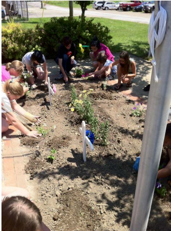
A dedicated and energetic group brought the bloom back to the flower beds in the Children's Garden at 1 p.m. June 10 in Franchot Park. Boy Scouts raised the flag in a special ceremony. The Garden was dedicated 17 years ago in honor of all of the children that we've lost.