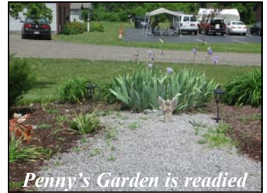
Penny's Garden is readied