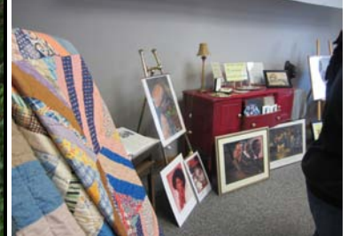
African American Center for Cultural Development