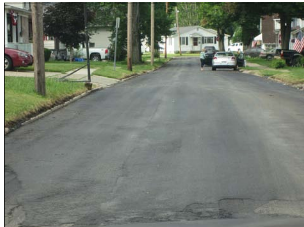
City crews began paving projects on June 12 in the area of 1st, 2nd and 3rd Avenues (above).