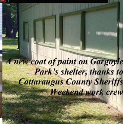
A new coat of paint on Gargoyle Park's shelter, thanks to Cattaraugus County Sheriffs Weekend work crew