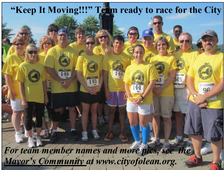
"Keep It Moving!!!" Team ready to race for the City