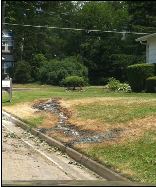
Downed power lines ignited and burned into this lawn on North Clark Street during the July 7 storm. There were some outages but all power was restored by Thursday, July 9.

A great crowd of Oilers fans and autograph-seekers came out to meet and support the Olean Oilers at War Vets Park on the evening of July 12.