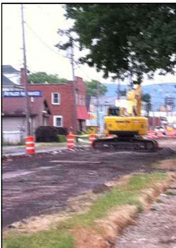
This "wide load" track excavator has an important job to do: bringing two-way traffic back to East State St.

Mark Cerrone, Inc., of Niagara Falls, won the Phase I contract with a tentative completion date of July 2013. Bids for the Phase II work eastward to Clark St. will be opened on July 16. That portion of the project will begin mid-